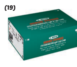
SCRUB TYPHUS (TSUTSUGAMUSHI) IgM & IgG CARD