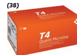
T4 QUANTI MICROLISA