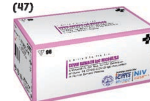
COVID KAWACH IgG MICROLISA