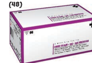
COVID 19 (IgM+igg+IgA) MICROLISA