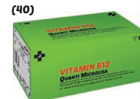
VITAMIN B12 QUANTI MICROLISA