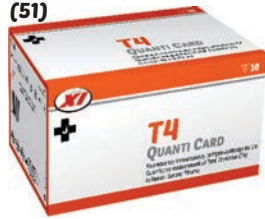
T4 Quanti Card