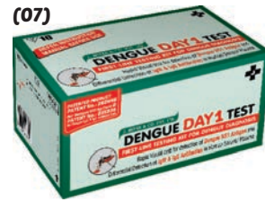
Dengue DAY 1 Test