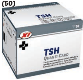
TSH Quanti Card