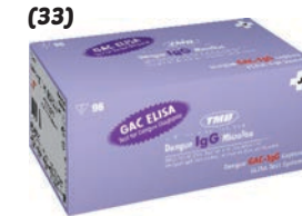
DENGUE IgG MICROLISA