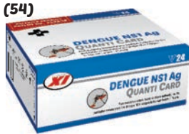
Dengue NS1 Ag Quanti Card