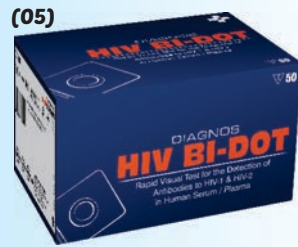
DIAGNOS HIV Bi-Dot