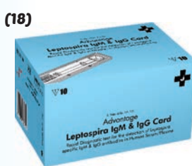
ADVANTAGE LEPTOSPIRA IgM & IgG CARD