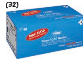
DENGUE IgM MICROLISA