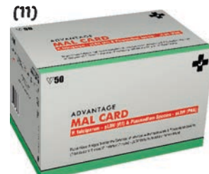
ADVANTAGE Mal CARD