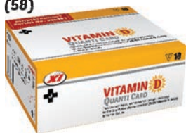
Vitamin D Quanti Card