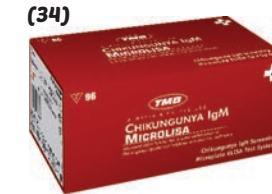
CHIKUNGUNYA IgM MICROLISA