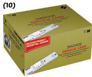
DIAGNOS DENGUE CARD