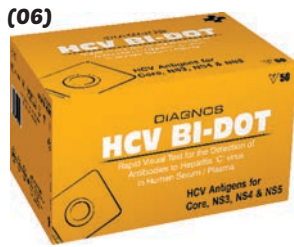
DIAGNOS HCV Bi-Dot