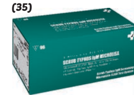
SCRUB TYPHUS IgM MICROLISA