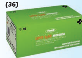
LEPTO IgM MICROLISA