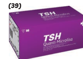
TSH QUANTI MICROLISA