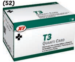
T3 Quanti Card