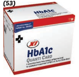
HbA1c Quanti Card