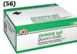
Dengue IgG Quanti Card