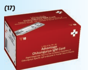
ADVANTAGE CHIKUNGUNYA IgM CARD