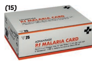
ADVANTAGE P.f MALARIA CARD