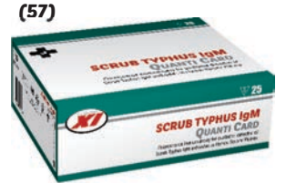
Scrub Typhus IgM Quanti Card