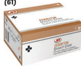
Ferritin Quanti Card