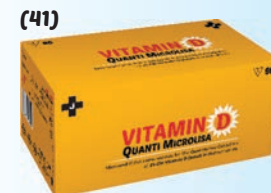
VITAMIN D QUANTI MICROLISA