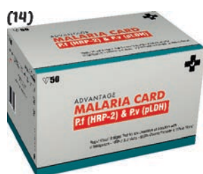
ADVANTAGE Malaria CARD