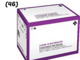
COVID 19 NEUTRALIZING antibody MICROLISA