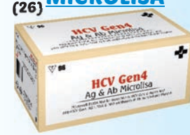
HCV GEN4 Ag & Ab MICROLISA