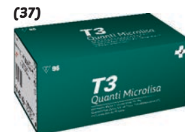
T3 QUANTI MICROLISA