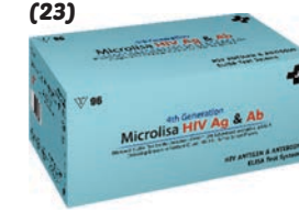
MICROLISA HIV Ag & Ab