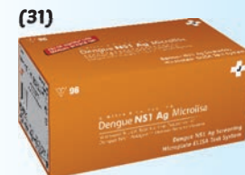
DENGUE NS1 Ag MICROLISA