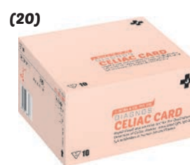
DIAGNOS CELIAC CARD