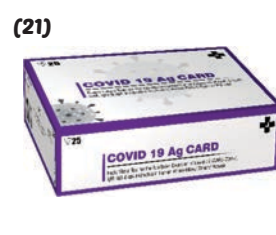
COVID 19 Ag CARD