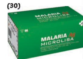
MALARIA Ag MICROLISA