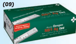
ADVANTAGE DenGUE NS1 Ag CARD