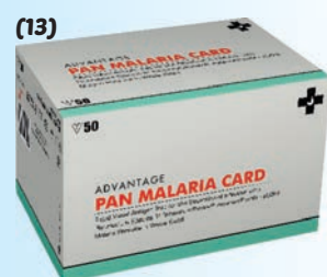
ADVANTAGE Pan MALARIA CARD