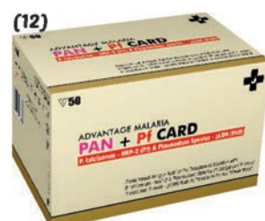
ADVANTAGE Malaria PAN +PF CARD