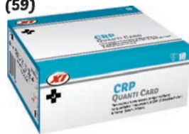
CRP Quanti Card