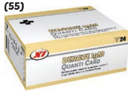
Dengue IgM Quanti Card