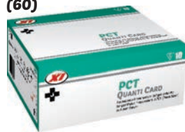
PCT Quanti Card