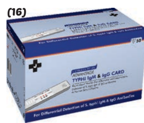
ADVANTAGE TYPHI IgM & IgG CARD